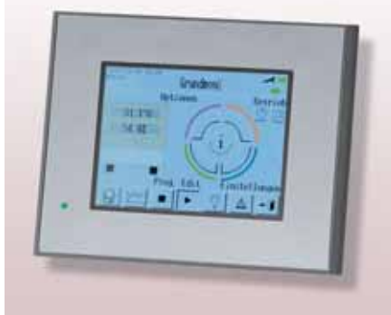
Example of a terminal

Our trained technicians not only carry out on-site qualification on request, but utilize also the extensive measurement and calibration facilities of our accredited DKD laboratory.